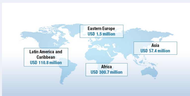
Box Figure 1. Regional Reported Revenue Increases from TIWB Assistance

The TIWB initiative has continued to evolve to meet the needs of developing countries. One of those needs has been for greater input from industry experts, e.g. from the diamond, floriculture, oil and gas, forestry and mining sectors. The enhanced sectoral focus of TIWB on the mining sector will be bolstered by the OECD's strengthening partnership with the Intergovernmental Forum on Mining, Minerals, Metals and Sustainable Development (IGF). IGF will provide industry experts, raise demand for TIWB programmes among its 71 members and promote inter-agency co-operation in the host countries undertaking TIWB programmes in the mining sector. The TIWB initiative also places an increasing emphasis on enhancing South-South co-operation to help ensure developing country perspectives remain at the forefront in the audit assistance provided.